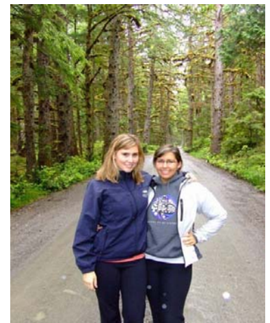
Visitor Councilors from the Prince Rupert Visitor Centre enjoy the scenery along Tow Hill Road during their Fam tour in June.

“Last year the HGTA supported more than a dozen media and familiarization tours for travel writers, tour leaders, visitor centre workers and other Industry professionals”