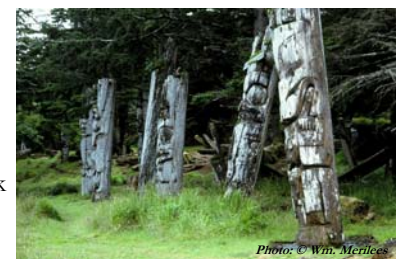
Skung Gwaii, (Ninstints) UNESCO World Heritage Site