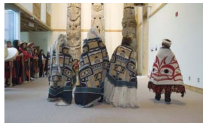
3 Totem poles were raised at the Haida Heritage Centre at Kaay Llnagaay leading up to the Centre’s opening on August 23rd