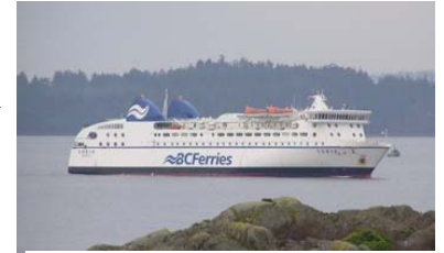
MV Northern Adventure

The Northern Adventure will service the popular and scenic inside passage route along the north coast during the 2008 summer season before moving to regular crossings of Hecate Strait.