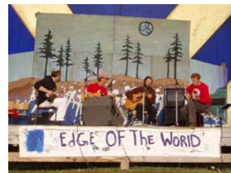
This festival theme for 2008 is “Home on the Edge”