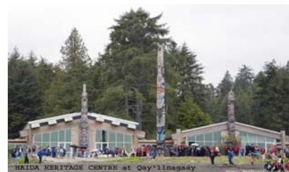
The Haida Heritage Centre at Qay’lnagaay, near Skidegate