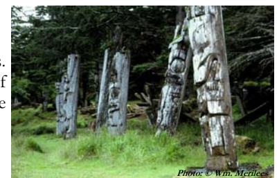
Totem poles at SGang Gwaay, UNESCO World Heritage site within the Gwaii Haanas National Park Reserve and Haida Protected Area