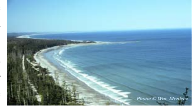
View overlooking the Agate Beach Campground from the Tow Hill Viewpoint.

Many visitors beach comb along North Beach hunting for treasures washed ashore by the Japanese current or observe the plentiful bird life in the area.