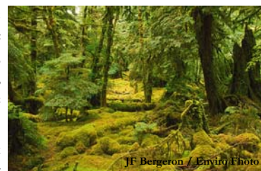
Forests, lush with moss are common all over the Islands.